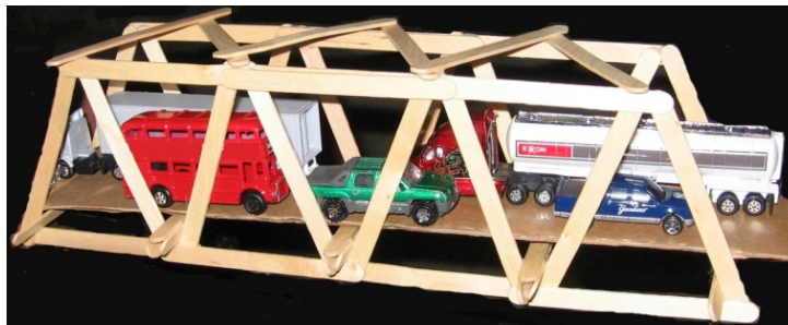
Figure 2. Truss Bridge Problem (TBP)

The Rich Learning Task that was designed consisted of the photograph shown in Figure 2, followed by a set of questions relating to numbers of paddle pop sticks required for the side of this bridge, and the pattern that describes how many paddle pop sticks would be required for any length bridge. The questions also encourage thinking about other situations that may use this type of pattern.